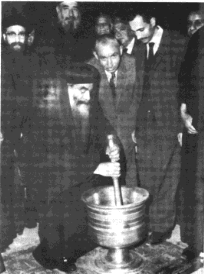
The Pope Making the Holy Mayroon

The ministry of culture had filmed this event and it was aired locally and internationally, this event was also covered by other European and American associations which had sent their representatives to Cairo specifically for covering this event.