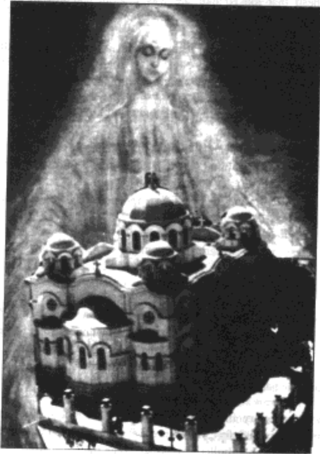
St. Mary's Church at Zeitoun