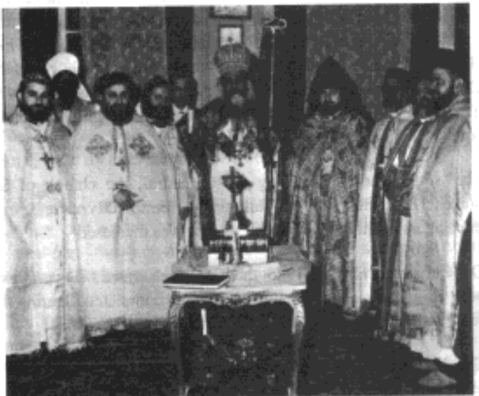
The Pope with the representatives of the Eastern Orthodox Churches

These have been signs showing God's work with this saintly man but we don't want to forget that it all took place while the Pope was in great tribulations: those from the devil, and those from enemies inside and outside.