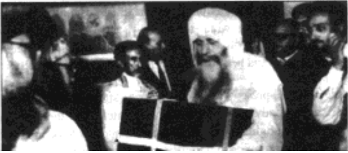
The Pope carrying the Relics of St. Mark